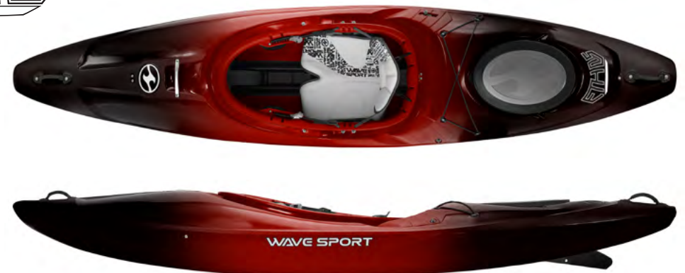
ETHOS TEN WhiteOut