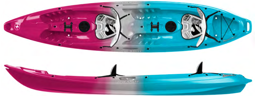
SCOOTER X TANDEM WhiteOut