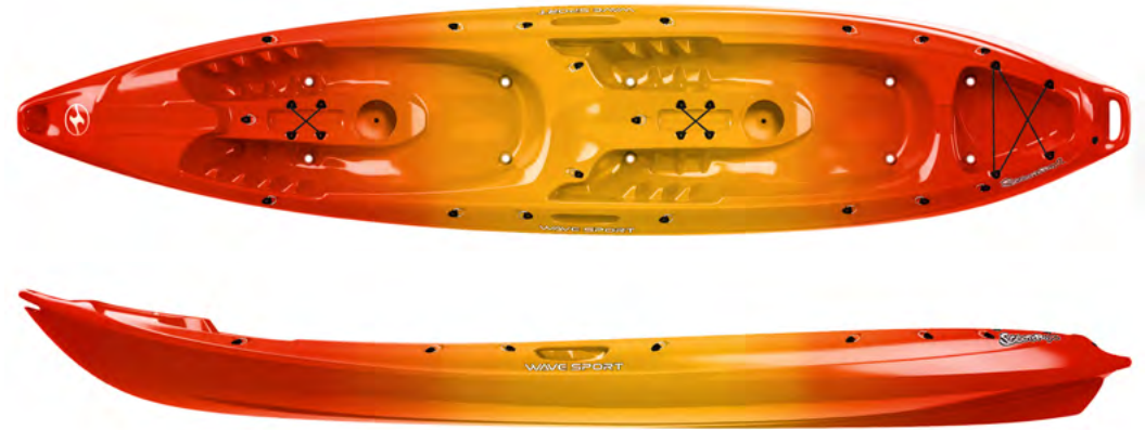
SCOOTER X TANDEM RENTAL